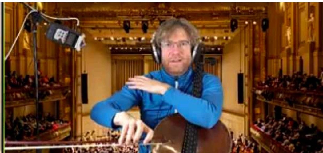
Virtual cello masterclass with Johannes Moser